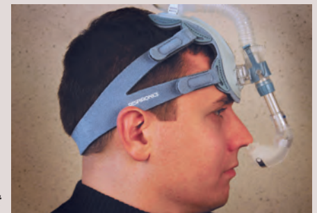
Correct Headgear Placement

Tighten the lower straps to provide a firm yet comfortable level of stability. The lower straps can be worn over or above the ears. The back strap should be pulled down toward the back of the neck for maximum support.