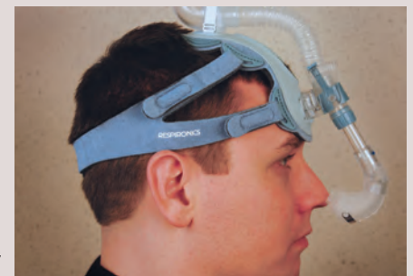
Incorrect Headgear Placement

If necessary, adjust the upper straps. Do not over-tighten the upper straps. This causes the back strap to rise up on the head and become less stable. If you experience issues with stability or ear irritation, move the top straps between the middle and top connection points to find the best fit.