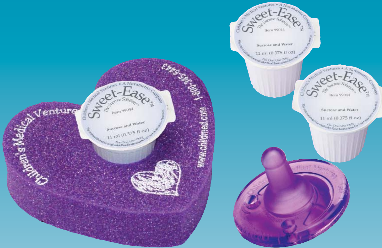
The Sweet-Heart Sweet-Ease® Holder