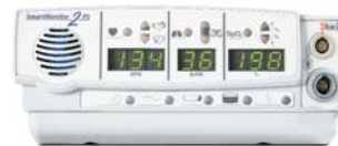
SmartMonitor® 2 PS Product Number 1014557

Customer Service: 1-800-345-6443 or 724-387-4000 Respiroics Europe: +33-1-55-60-19-80 Respiroics Asia Pacific: +81-3-5280-9611