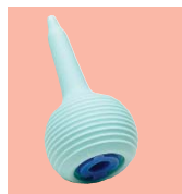
Bulb-Style Syringe Nasal Aspirator (for hospital and home use)

This safe, easy to use bulb-style syringe nasal aspirator from The First Years® provides gentle suction to remove excess mucus or oral secretions. The First Years® Aspirator is safer than most bulb syringes: an over-insertion guard helps avoid inserting the tip too far into the baby's nostril and a pull-out plug in the bottom makes it possible to thoroughly clean the interior. This pediatrician-approved nasal aspirator has previously been available commercially to parents, but is now offered to hospitals through Children's Medical Ventures.