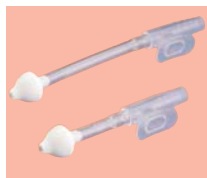
BBG™ Nasal Aspirator (for hospital use)

Developed in conjunction with Miami Children's Hospital, the BBG™ Nasal Aspirator allows easy and safe suctioning of the nasal or oral cavity. The clear bendable tube allows flexible positioning of the tip for a variety of patients in any position.