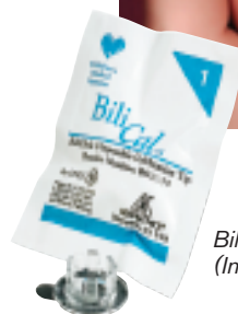
BiliCal™ (Individual Calibration Tip)